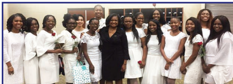
Welcome to the Beta Phi Chapter at Florida A&M University

The 2018 National Leadership Conference (NLC) was held in Stillwater, Oklahoma, and we continued our commitment to leadership development by inviting all District Officers to participate in NLC along with our National Council and District Counselors. Throughout our time together, the District Officers learned about District and National Operations, how to create and achieve attainable goals, how to identify and work with different leadership styles and personality types, and how to plan and execute the National Programs of the Sorority. We also took time together to visit our National Headquarters. The District Officers enjoyed viewing their petitioning documents and other treasures inside the station, and our whole group joined together to sing in the Wava Memorial Garden.