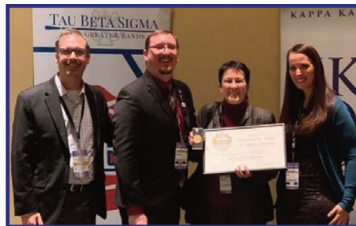
Dr. Jennifer Higdon (Curtis Institute of Music) receives the Outstanding Service to Music Award at the 2018 Midwest Band and Orchestra Clinic.