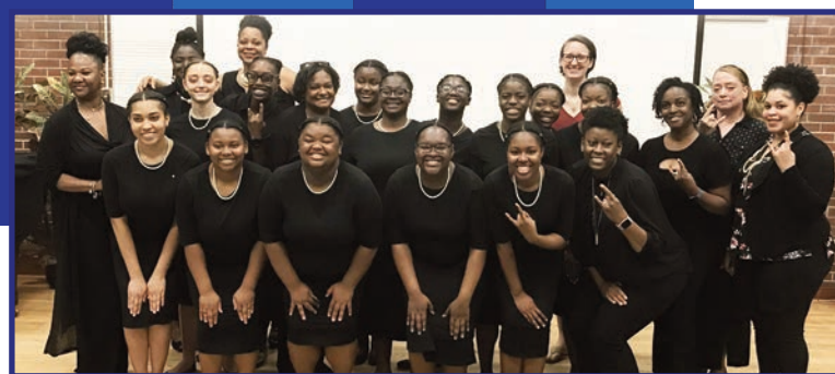
Welcome to the Theta Alpha Chapter at Fayetteville State University