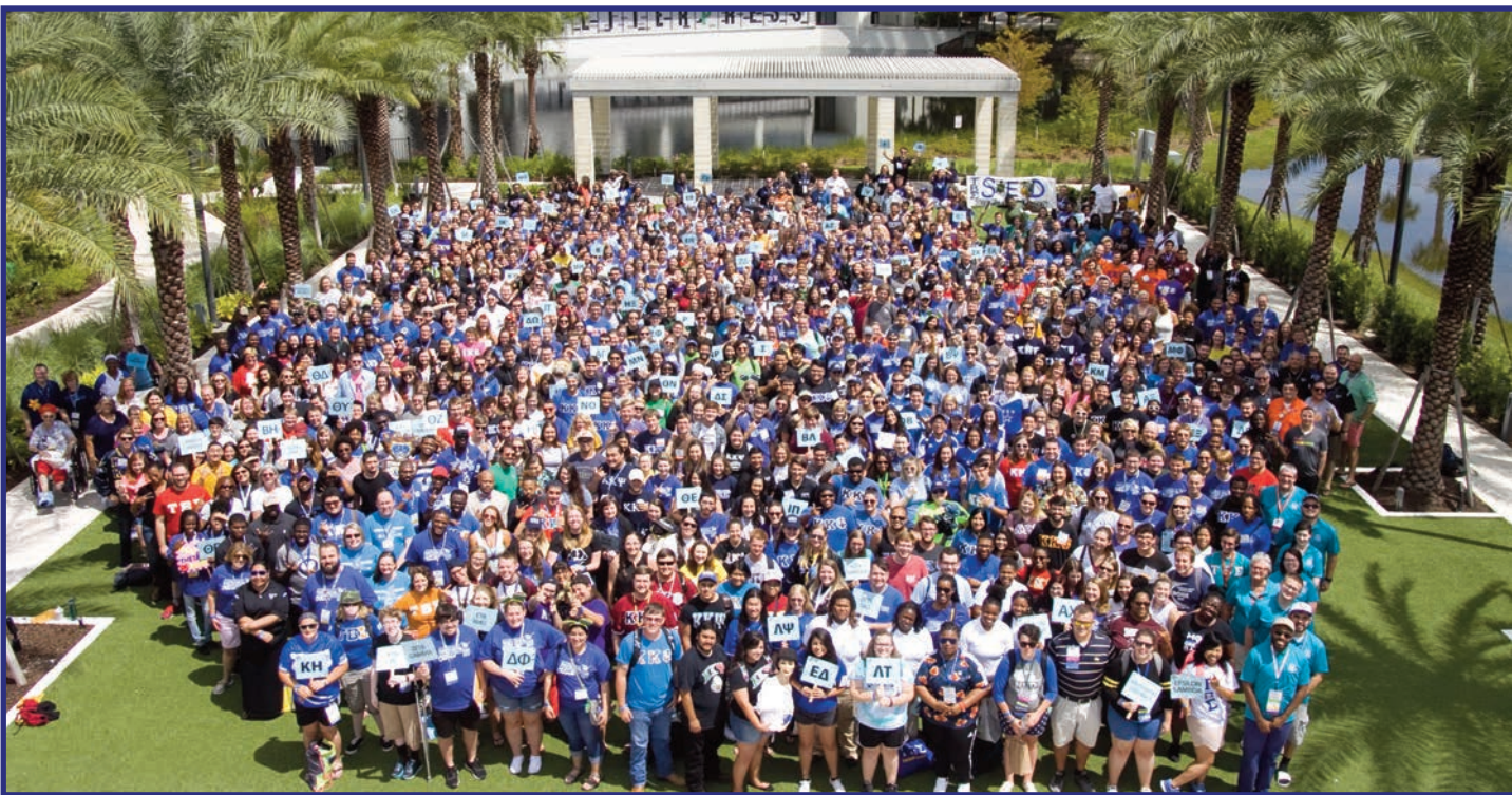
National Convention 2017 in Orlando, Florida