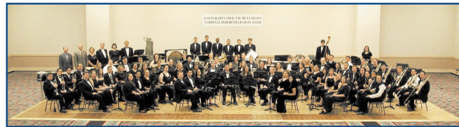
2001 National Intercollegiate Band